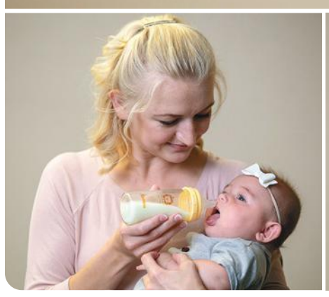
Tip 3: Brush the bottle nipple across your baby's upper lip. Wait for baby's mouth to open.