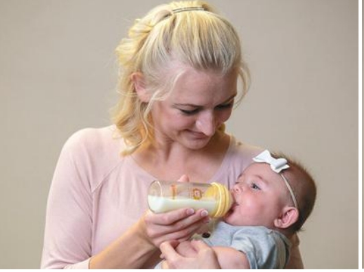
Tip 4: Hold the bottle in an almost flat position. This position keeps the formula or pumped milk from pouring into your baby's mouth. The nipple will fill and your baby will suck on the bottle.